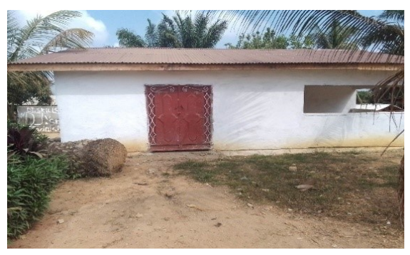
Newly Constructed Cafeteria

Second, our long-time dream and prayer to provide meal for the students and staff is being answered. Below are photos of the progress we've made with help of the "World Food Program (WFP). Meals will be served three days a week. The Administration will need additional funds to purchase additional utensils, and ingredients. Also toprovide stipends for the two volunteer cooks. The WFP does not cover those expenses.