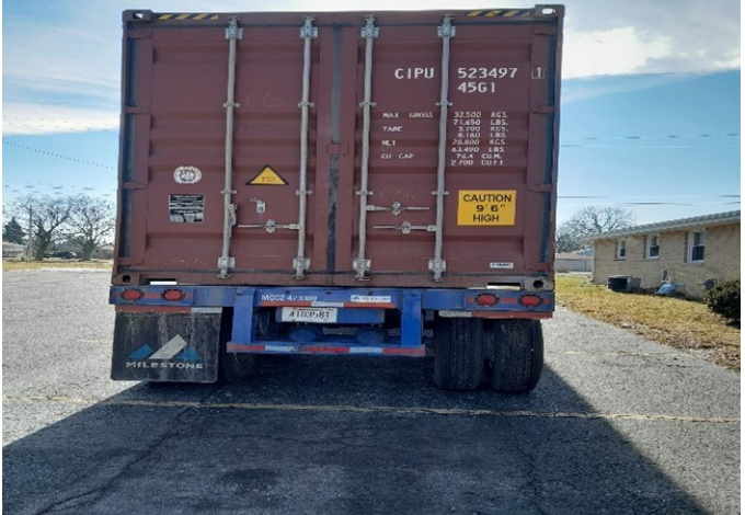
40 foot cargo container on the road to Liberia!