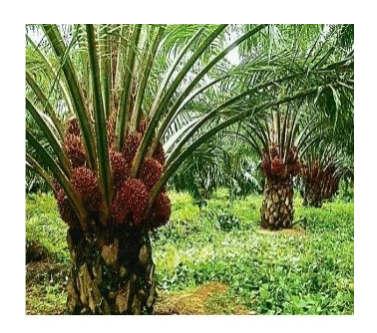
A Palm Tree Farm