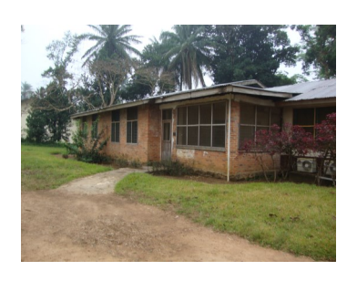
Ganta Guest House c. 2014

An acre of land would hold 50-60 palm trees. They grow in rich tropical soil that does not need watering except when in a nursery. The trees take three to five years to begin bearing bunches and the bunches increase overtime while ripening and harvesting are done yearround.