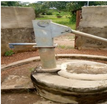
Renovated hand pump on the well.