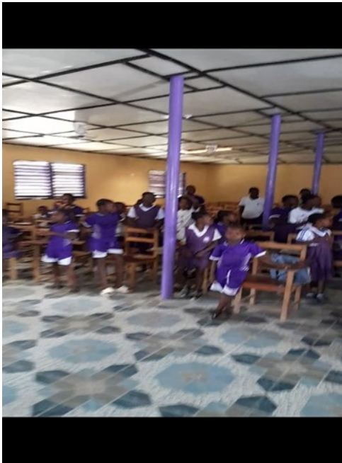
MID-WEEK CHAPEL SERVICE-JABEZ SCHOOL

Per the government's mandate, and at the discretion of the school's administration, some of the older kids who really did well in all their lessons were given "Double promotions," to grade two instead of one.