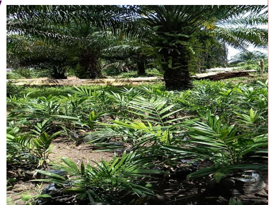
PALM NURSERY READY FOR TRANSPLANT

https://photos.app.goo.gl/GY5MzTEfH564Lrsu7 / https://photos.app.goo.gl/mFobkTtD9WmfyRwz7