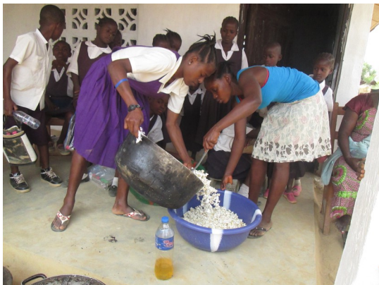
Jabez students making popcorn at the End of School Year party.